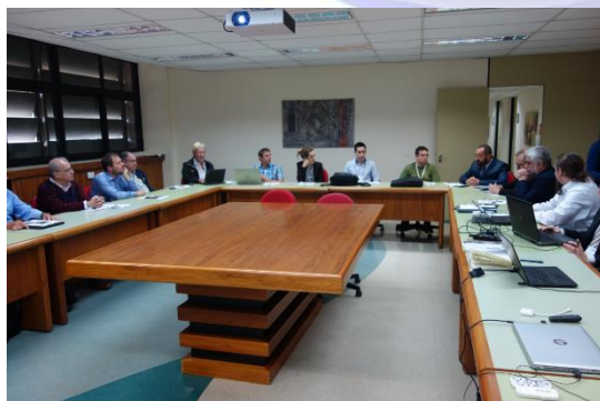
The project group brainstormed additional applications for the pico-satellites

The project group made key progress together on “TIM”, including discussions on possible additional applications, such as agriculture, once they are in orbit in 2021. The group is now looking at a formation of up to 12 pico-satellites, and is intensively preparing for all satellites from the partner regions to be ready at the end of 2020. Additional aspects, such as cameras, testing facilities, and mechatronic components are key aspects, and are being supported through regional commitments. The partners also discussed possibilities for a “TIM2”. The project demonstrates the concrete cooperation on Earth reaching new heights as partners work towards launch.