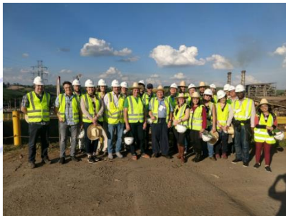
Visit to Raizen, an ethanol plant

Researchers from across the partner regions and from all four RLS-Sciences themes met for five days at the National Space Institute (INPE) Integrated Testing Laboratory (LIT) campus. Each group had two days for internal working meetings, presentations, and brainstorming, with a third day being dedicated to inter-project exchanges, overall RLS-Sciences development discussions, and inputs from the scientific side for the next Regional Leaders Summit in 2020, in Linz, Upper Austria on the theme, "Smart Regions". Participants were then invited to join technical site visits held over two days, including trips to the testing facilities of LIT, an ethanol plant, aerospace company Embraer, and the National Center for Research in Energy and Materials.