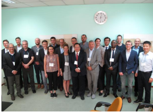
The Energy Network researchers

The Energy Network had two days full of exchanges on a variety of interlinking topics, including climate change and energy, biofuels, smart energy grids and storage, and energy efficiency. The exchanges also addressed topics such as interdisciplinarity in research, and the social acceptance of new energy technologies.