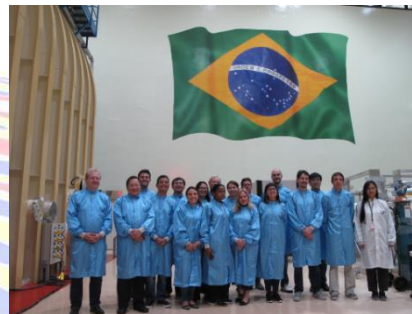
Visit to LIT, where satellites are tested