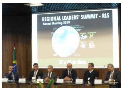
Opening Session of the conference